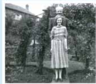
Uncle and Auntie Cornish in their garden in Marple, outside Manchester, England, 1939.