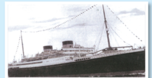
The Britannic, on which we sailed to the United States in 1940, was later a troop ship during World War II.

In the spring of 1940, my father was informed that we had received permission from the American consulate in London to leave for the United States where we would all be reunited.