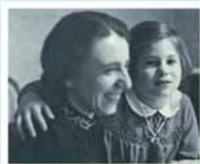
One of my favorite pictures of my mother and me.