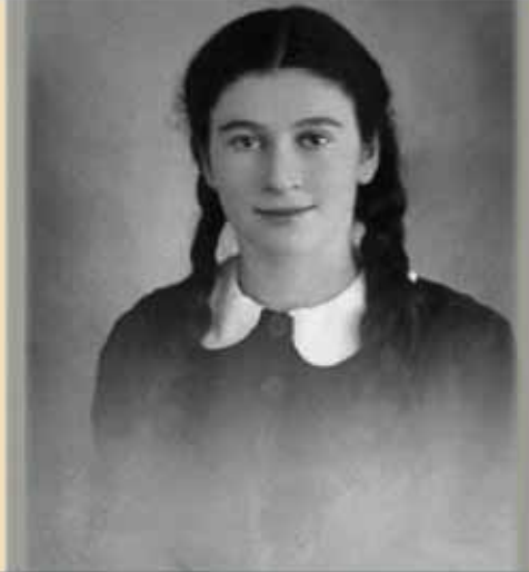
Gerda Weissmann Klein Holocaust Survivor