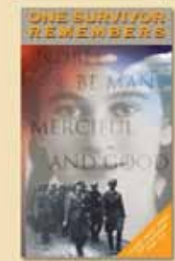
Movie: One Survivor Remembers