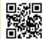
One Survivor Remembers (Film)