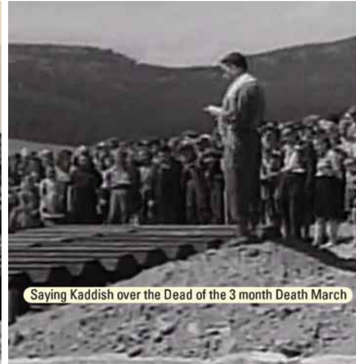
Saying Kaddish over the Dead of the 3 month Death March

In 1945, she was sent on a forced 350-mile death march to avoid the advance of Allied forces. 4000 Women Marched - Less than 120 survived. She was one of the minority who survived the forced journey.