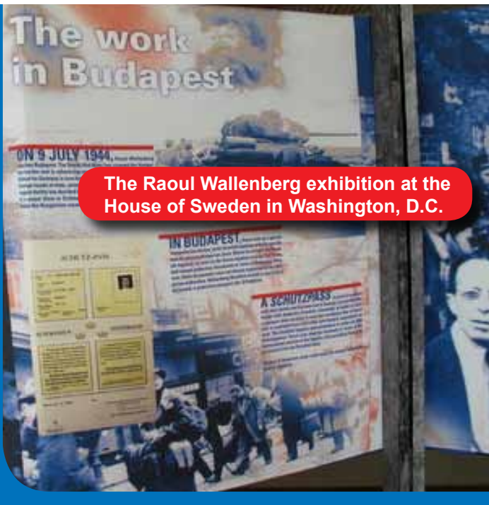
The Raoul Wallenberg exhibition at the House of Sweden in Washington, D.C.