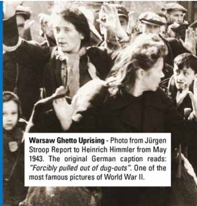
Warsaw Ghetto Uprising - Photo from Jürgen Stroop Report to Heinrich Himmler from May 1943. The original German caption reads: "Forcibly pulled out of dug-outs". One of the most famous pictures of World War II.

Resistance — The Warsaw Ghetto Uprising by Israel Gutman Published by Houghton Mifflin in association with the United States Holocaust Memorial Museum