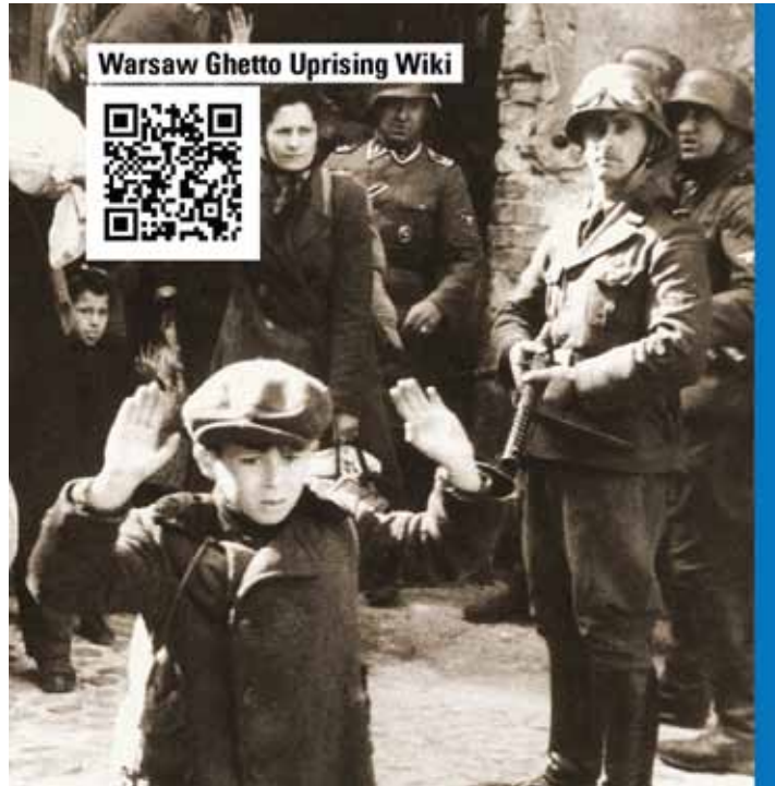
Warsaw Ghetto Uprising Wiki