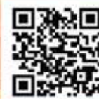
Miles Lerman U.S. Holocaust Museum

Miles Lerman, Chairman of the United States Holocaust Memorial Council, from 1993 to 2000, led a partisan unit against German occupying forces in southern Poland during World War II.